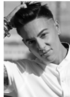
AD DIGGS Creator of DiggTheKicks, a sneaker/clothing line and VH1's Love & Hip-Hop: Hollywood personality.