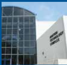
ATA / ATB